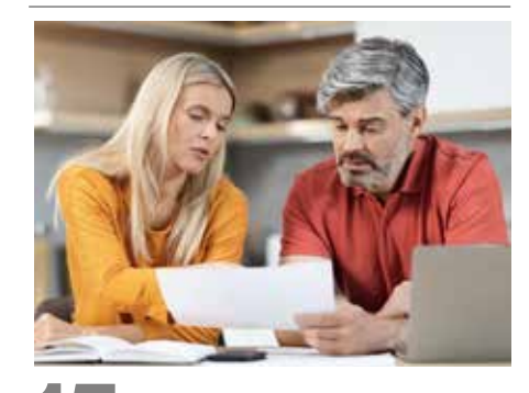
PERFECT STORM Major long term ramifications for financial health and wellbeing