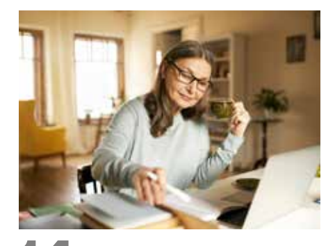
FEELING THE PINCH Women more vulnerable to cost-of-living crisis